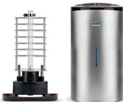
AS20 // AS20X // AS20M