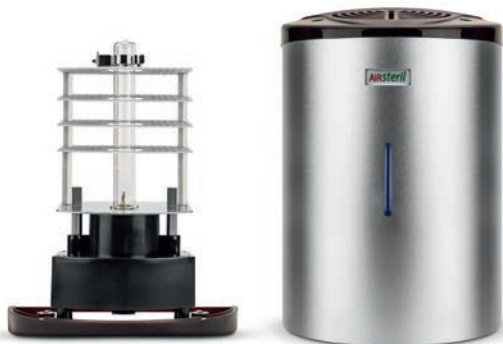
AS10 // AS10X